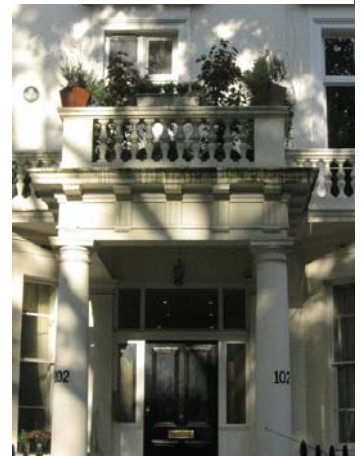
What a lovely welcome this balcony above the portico presents.

It seems that for many of us, gardening is just what the doctor ordered.