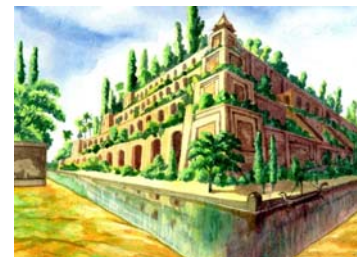
Early balcony gardening: hanging gardens of Babylon.

Despite the challenges, with a little planning, you, too, can create and enjoy a garden retreat high above ground!