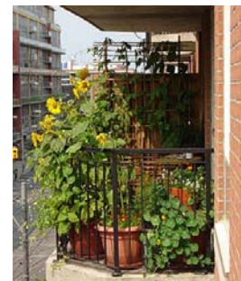
Flowers basking in the sun!

Shrubs & Trees: Purple-leaf Sand Cherry, Dwarf Lilac, Box Euonymous, Serviceberry, Weeping Crabapple, Standard Hydrangea, Dwarf Conifers