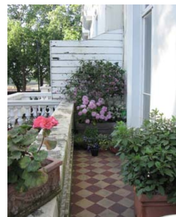
Small, but lush balcony garden in bloom.