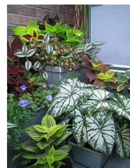
Colourful foliage plants flourishing in the shade